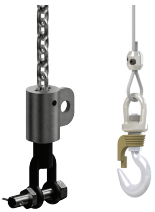
Cable or Chain

E-Float Hoist™ offers flexible options: with or without I/O, cable or chain lift, and a choice of three optional control handles. Please specify handle preference when ordering.