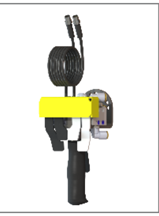
Four (4) Button Model# GMEPPTA9630 (Shown)