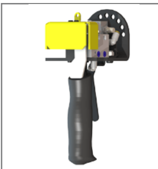
One (1) Button Model# GMBPTA9040 (Shown)