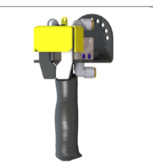
Two (2) Button Model# GMBPA9300 (Shown)