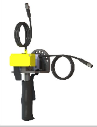
One (1) Button Model# GMEPTA9500 (Shown)