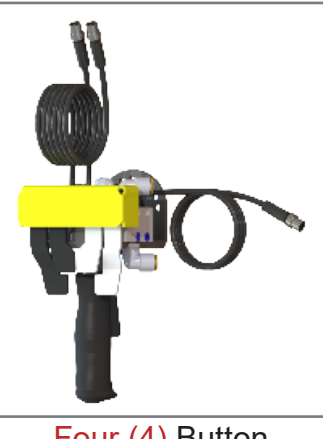
Four (4) Button Model# GMEPETA9630 (Shown)