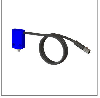
Trigger 4-Pin Micro Single Pole Limit Switch Knight's BPA9001 Pneumatic Valve Block Assembly has 3-Way valves used for sending common pilot signals.