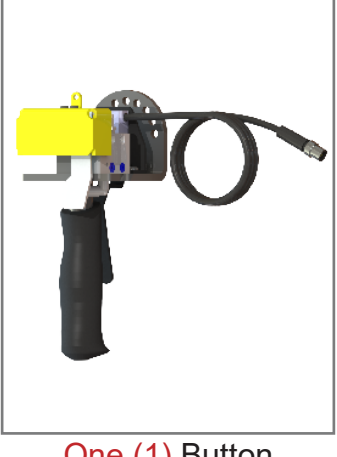
One (1) Button Model# GMBPETA9040 (Shown)