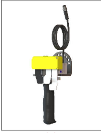
Three (3) Button Model# GMEPPA9150 (Shown)