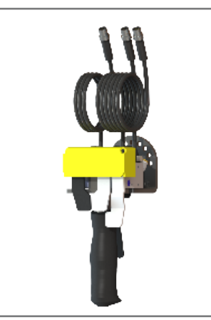
Three (3) Button Model# GMEPPTA9650 (Shown)