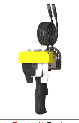
Four (4) Button Model# GMEPPTA9360 (Shown)