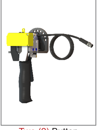
Two (2) Button Model# GMBPETA9100 (Shown)