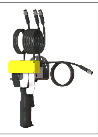
Three (3) Button Model# GMEPTA9650 (Shown)