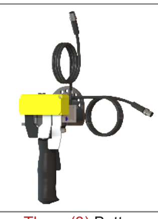
Three (3) Button Model# GMEPETA9150 (Shown)