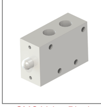
SMC Valve Block Assembly

Knight's BPA9111 Pneumatic Valve Block Assembly has 3-Way valves used for sending common pilot signals.