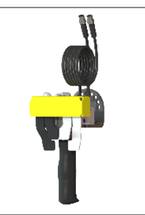
Four (4) Button Model# GMEPPA9360 (Shown)