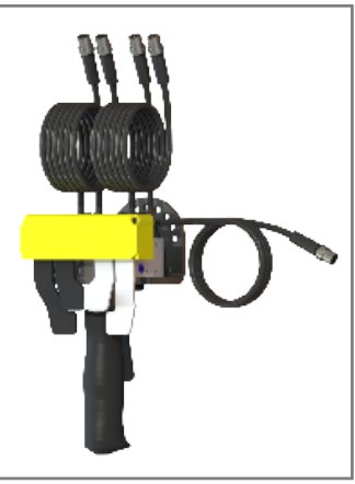
Four (4) Button Model# GMEPTA9660 (Shown)