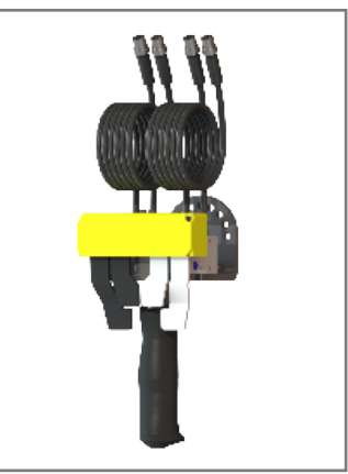
Four (4) Button Model# GMEPA9660 (Shown)