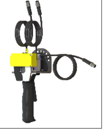
Two (2) Button Model# GMEPTA9600 (Shown)