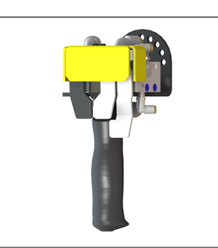
Three (3) Button Model# GMBPA9340 (Shown)