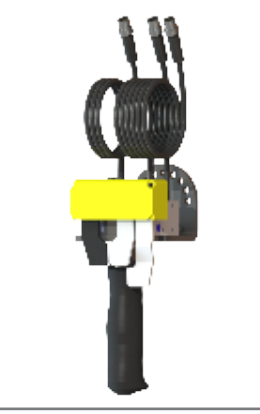
Three (3) Button Model# GMEPA9650 (Shown)