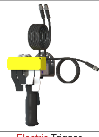
Electric Trigger Model# GMEPETA9360 (Shown)