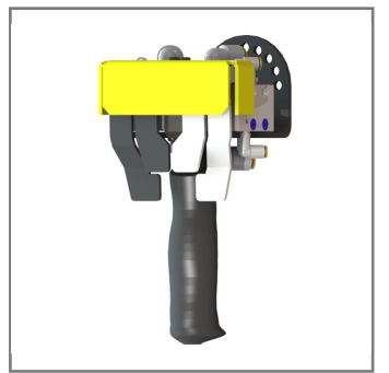
Four (4) Button Model# GMBPA9434 (Shown)