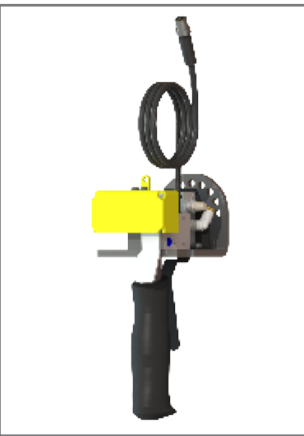
One (1) Button Model# GMEPPTA9050 (Shown)