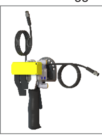
Three (3) Button Model# GMEPETA9530 (Shown)