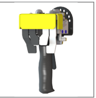
Four (4) Button Model# GMBPTA9434 (Shown)