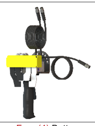
Four (4) Button Model# GMEPETA9360 (Shown)