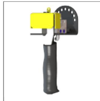
One (1) Button Model# GMBPA9040 (Shown)