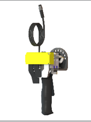
Three (3) Button Model# GMEPPTA9510 (Shown)