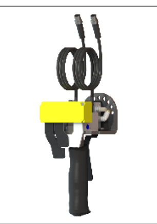
Pneumatic Trigger Model# GMEPPTA9460 (Shown)