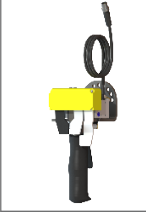
Three (3) Button Model# GMEPPTA9150 (Shown)