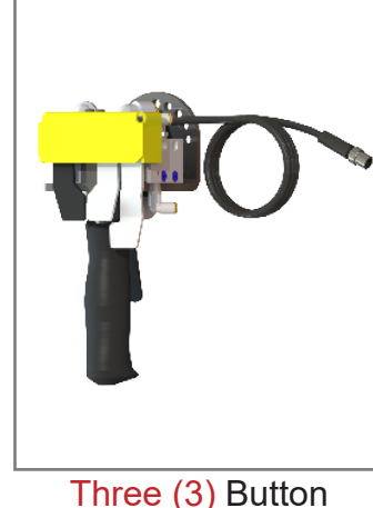
Inree (3) Button Model# GMBPETA9340 (Shown)