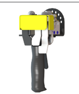
Three (3) Button Model# GMBPTA9340 (Shown)