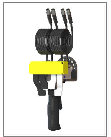
Four (4) Button Model# GMEPPTA9660 (Shown)