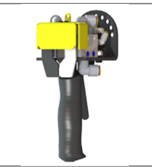
Two (2) Button Model# GMBPTA9300 (Shown)