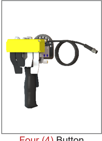
Four (4) Button Model# GMBPETA9310 (Shown)