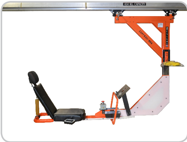
Custom Overhead Mounted Single Bridge Ergo Seat