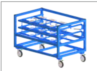
Dunnage Rack Carts

Cart lift systems position the cart and contents in a ideal ergonomic position so workers are more productive. They are equipped with cart to table interlock systems.