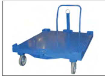
Forkless Tugger Carts

Designed per application. Open or fully enclosed with vinyl covers or solid doors. Available in a variety of configurations such as: Static Carts, Rotational Carts, Tilt Carts, Transfer Carts, Corral Carts and more.