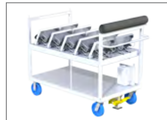
Controlled Drain Carts

Small footprint, fork-free lift that raises cart to operator working level. Rear wheels allow operator to transfer the empty cart to multiple locations without the use of a fork truck.