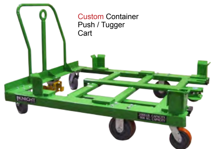
Custom Container Push / Tugger Cart