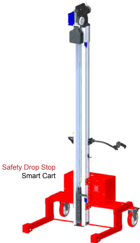
Safety Drop Stop Smart Cart