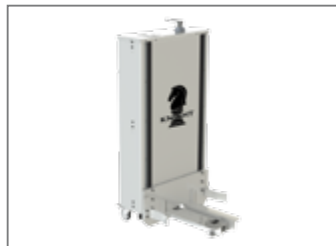
Portable Cart Lifts

Dunnage Racks are custom designed to store and transfer parts. Every rack is custom designed to your application. Multiple options and sizes are available.