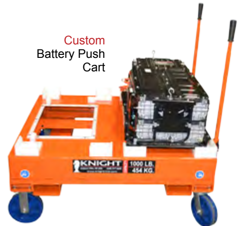
Custom Battery Push Cart

Carts are the ideal choice for transferring, lifting and/ or rotating products to an ergonomically correct position when portability is required. Knight Global Cart Systems are available in manually operated configurations or our electric operated Smart Cart configuration.